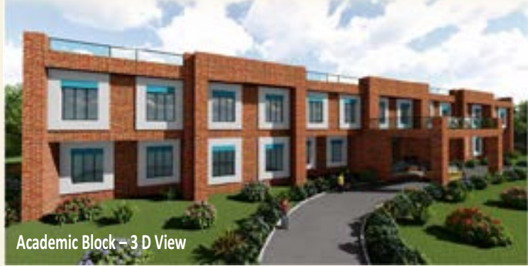
Academic Block – 3 D View

Rooted in the vision of building transformative leaders, the mission of Lady Doak College is to make quality higher education accessible to young women, irrespective of the socio-economic background. As part of this unwavering commitment, our institution is embarking on the enterprise of building a satellite campus at the Velichanatham village, a 20 minute drive away from the main campus. The first phase of the construction of compound walls is over and we seek to commence academic programmes at the satellite campus with the construction of the academic block - a crucial step towards bridging the educational divide between urban and rural communities, emphasising employability and whole person development.