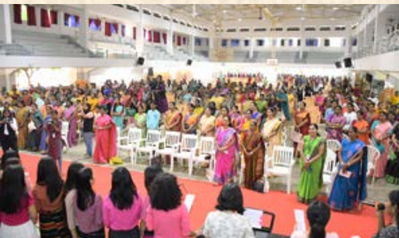
Alumnae Day Celebrations