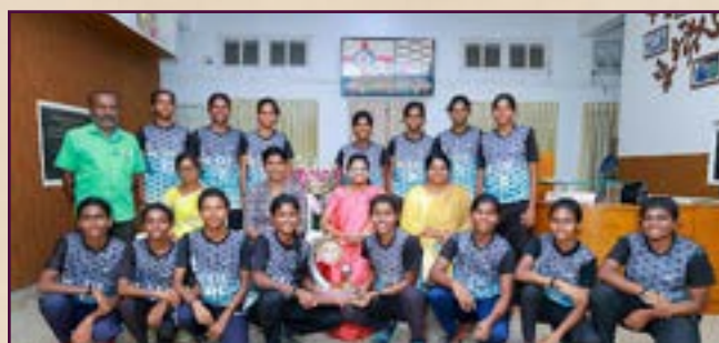
MKU Kho Kho Champions