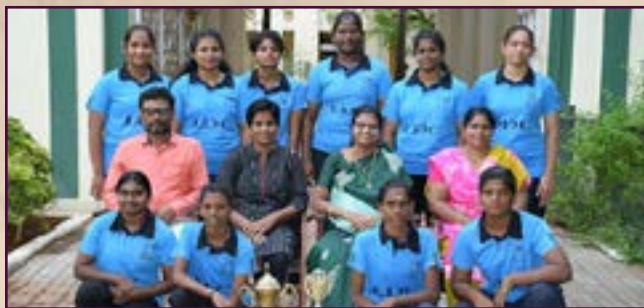
MKU Weightlifting & Powerlifting Champions