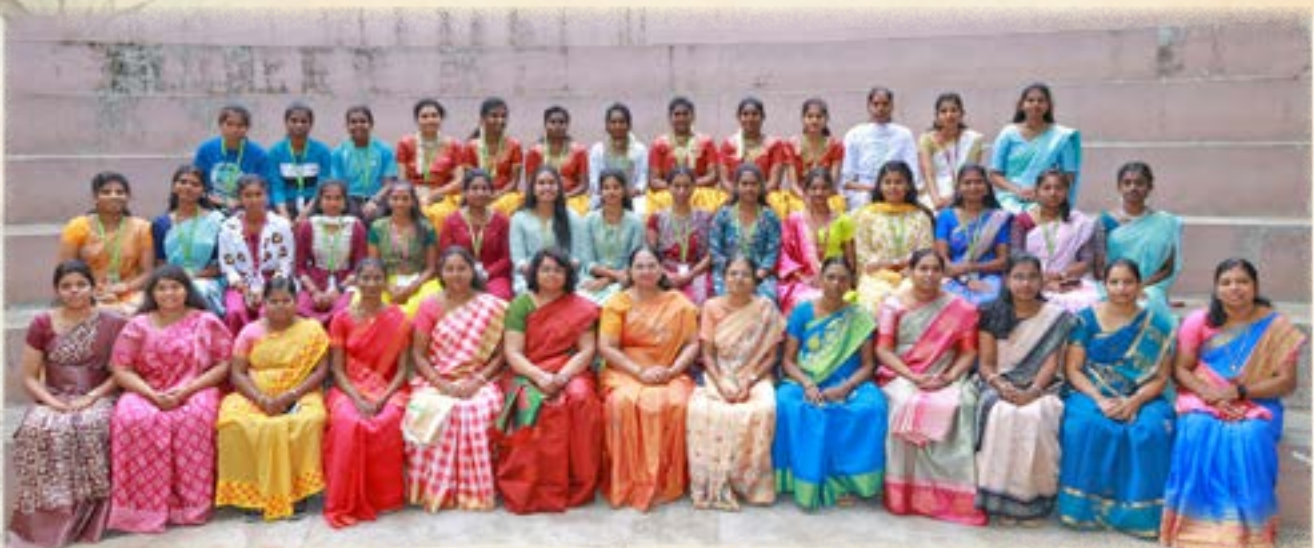
B.A. Economics (TM)