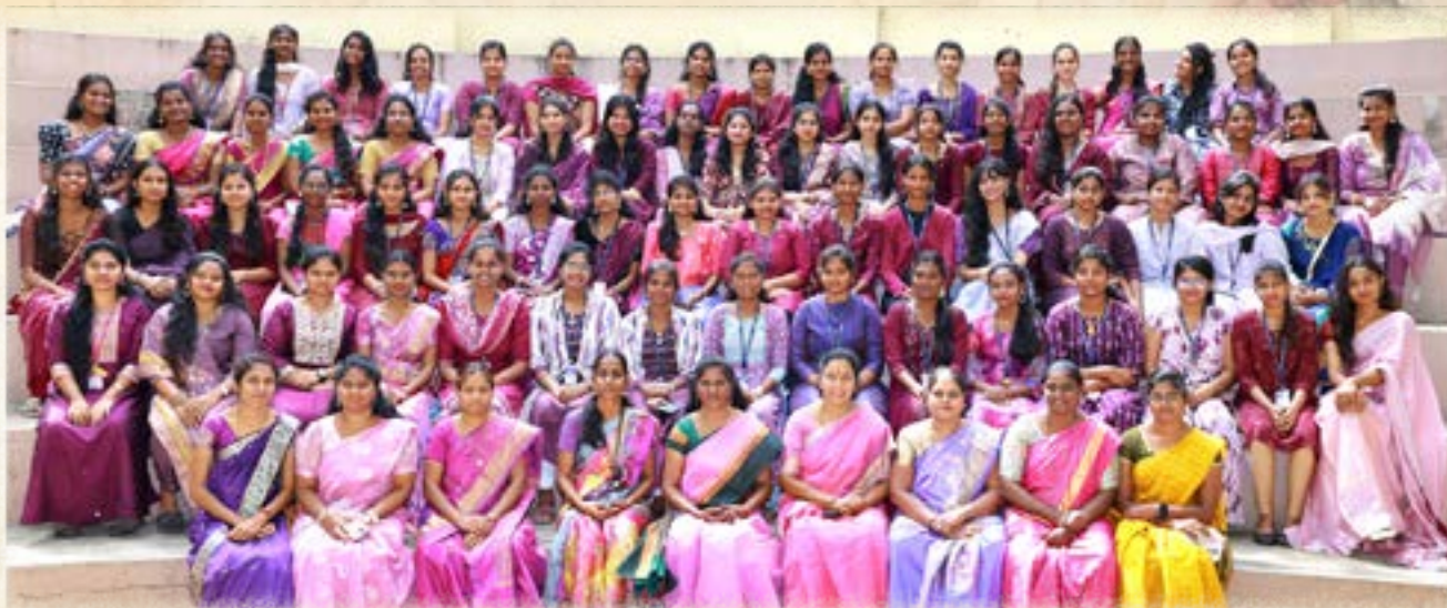
B.Com. Corporate Secretaryship