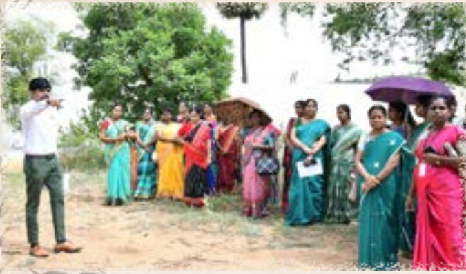
Satellite Campus Visit by Faculty