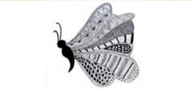
Harishmaa T 24PGM012