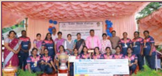
Throwball Champions in 5th State Level Intercollegiate Non Teaching Staff Throwball Tournament for Women