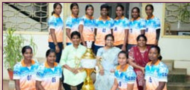
Kabaddi Players secured First Place in MKU Inter collegiate Tournament - 2024 at Rajapalayam