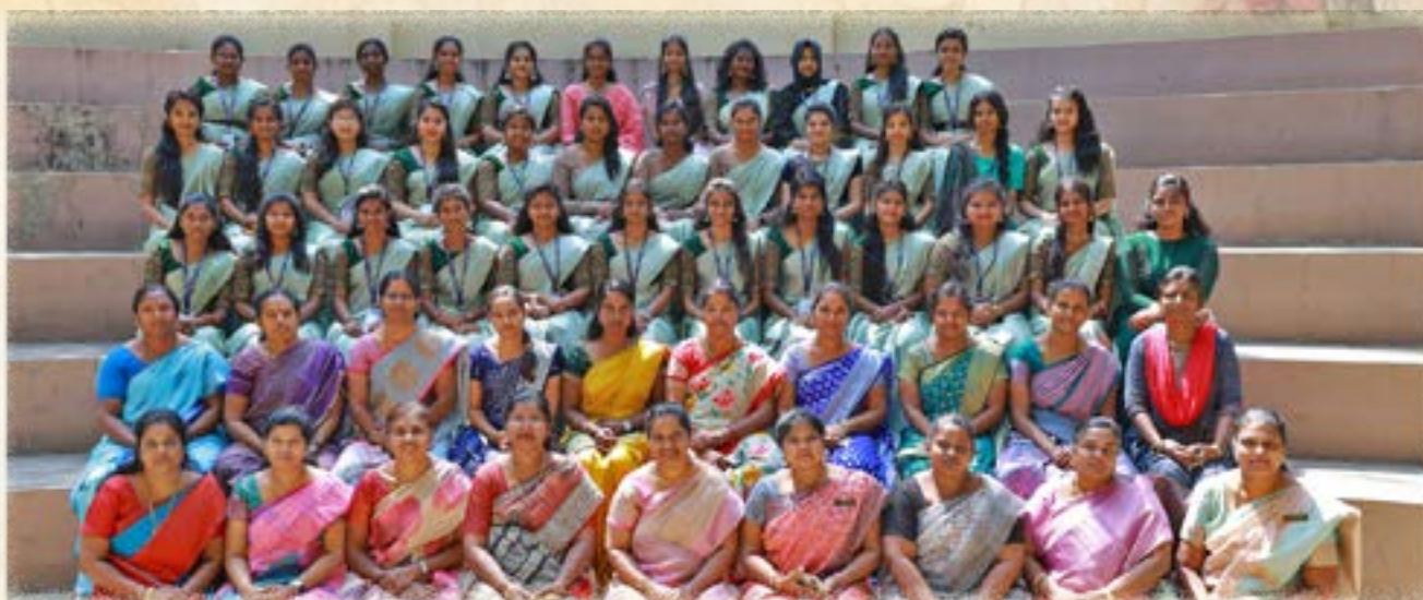
B.Sc. Information Technology & Management (A)