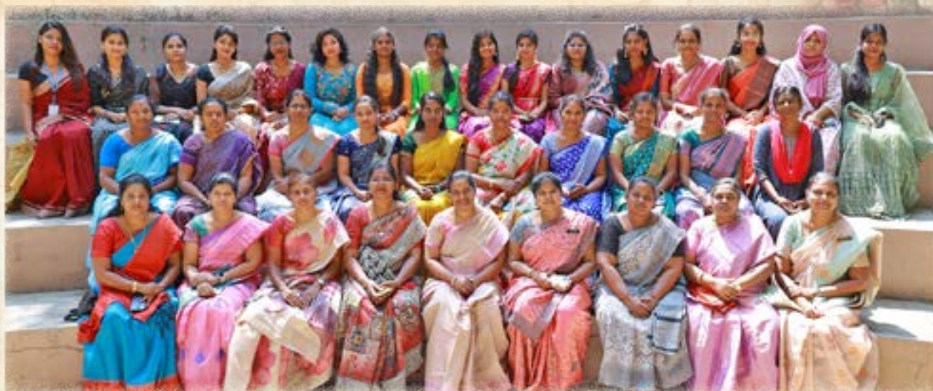
M.Sc. Information Technology