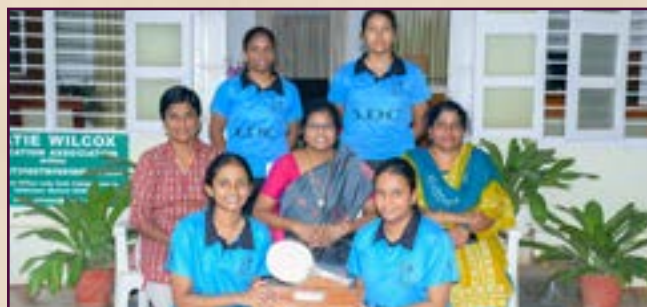
MKU Table Tennis Champions