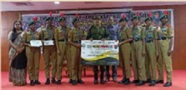
76th NCC Raising Day at NCC Training Academy, Idaiyappatti