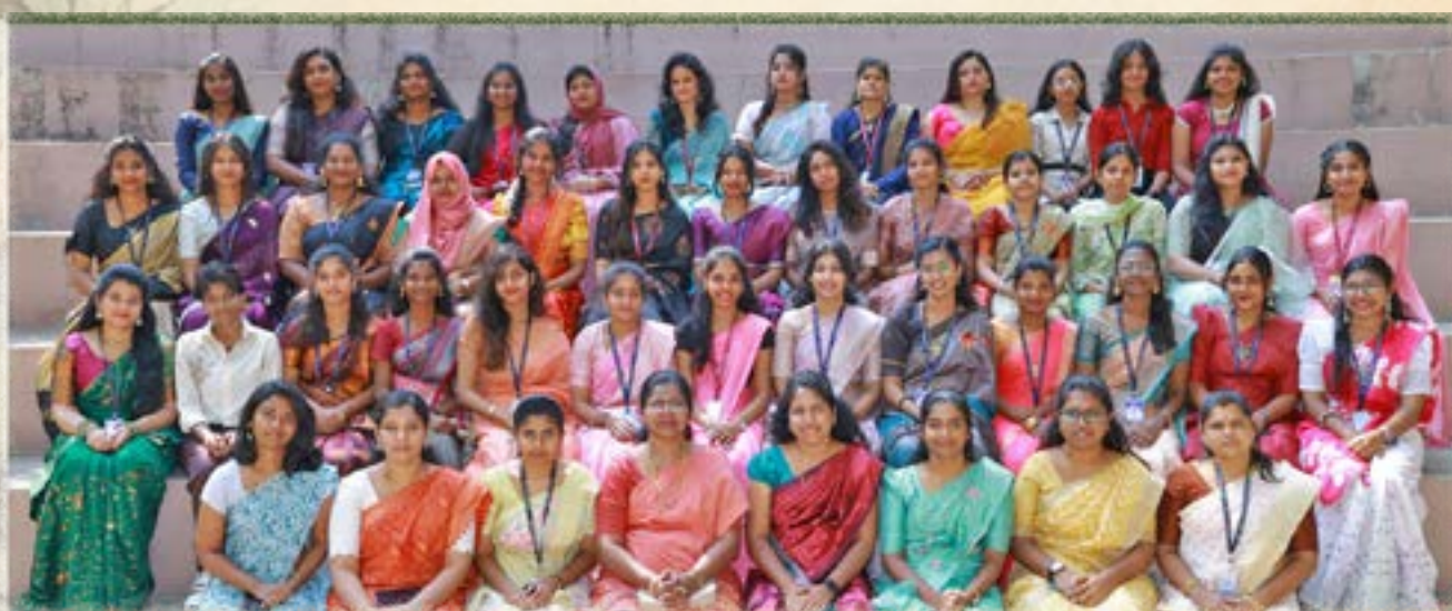
B.Sc. Costume Design & Fashion