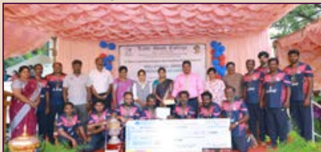
5th State Level Intercollegiate Non-Teaching Staff Volleyball Tournament for Men - 3rd Prize