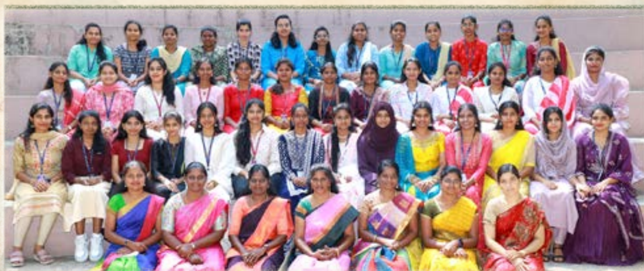
B.Com. Computer Applications