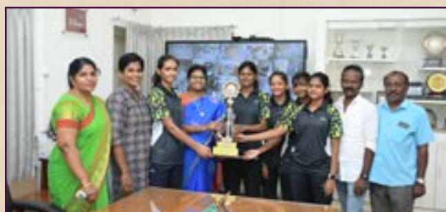
MKU Intercollegiate Badminton Champions