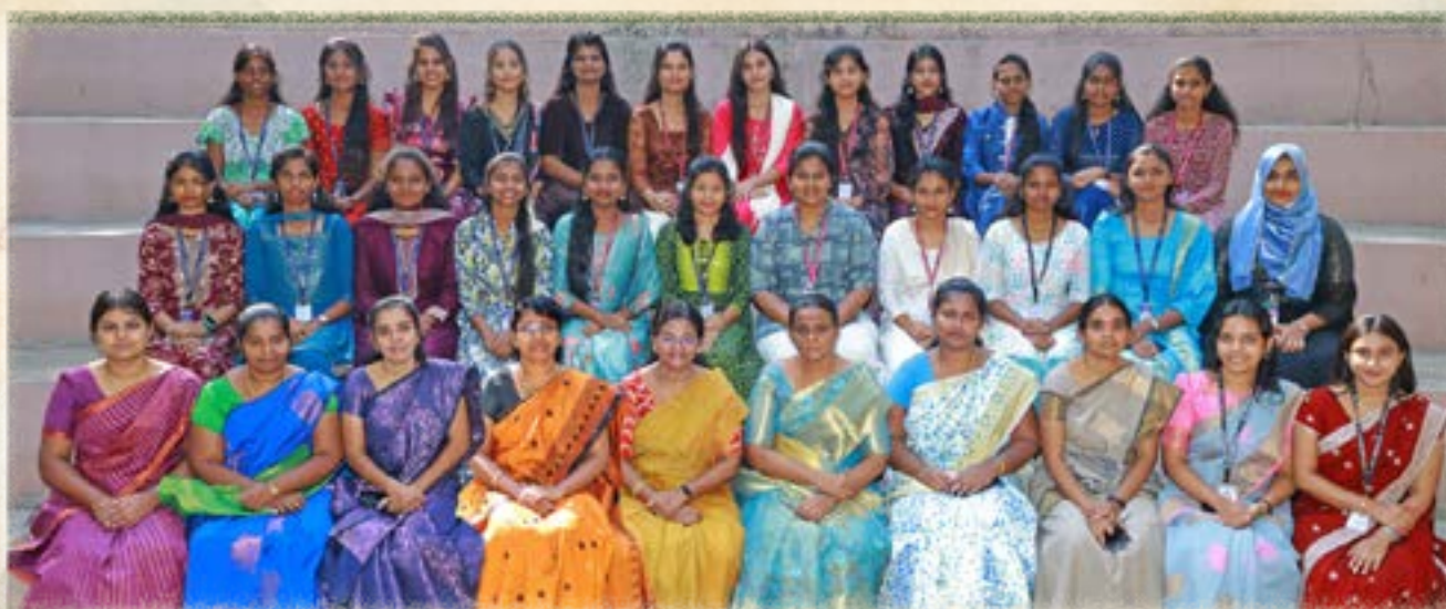
B.Sc. Physics with Computer Applications