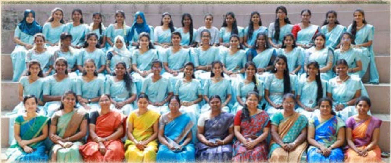
B.Sc. Mathematics (Spl.)