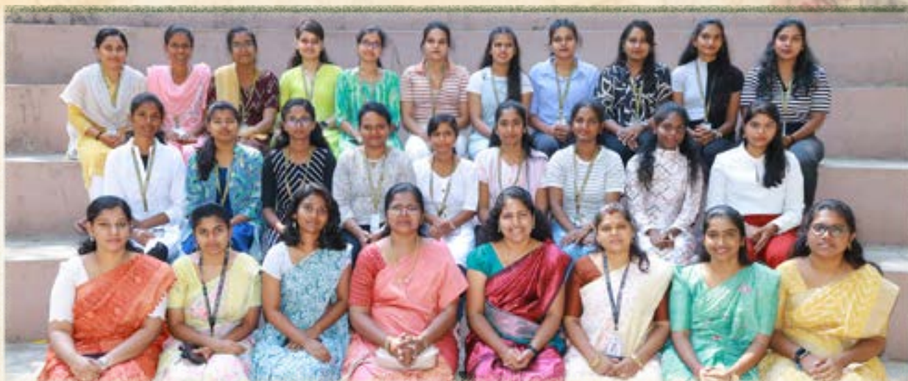
Diploma in Apparel Designing