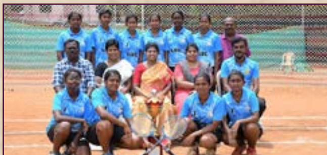
MKU Ballbadminton Champions