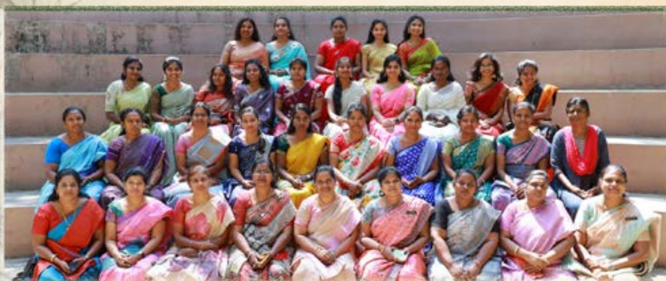
M.Sc. Computer Science