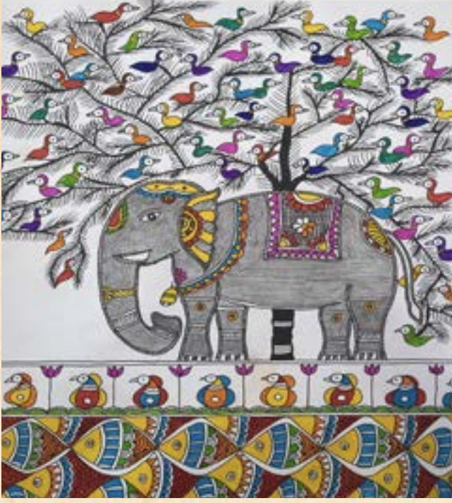
Soundarya T. 24PGZ010