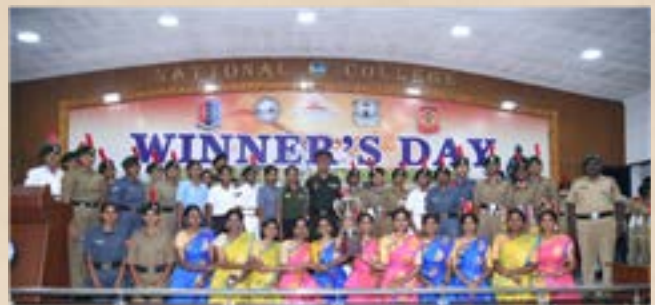
NCC Cadets won Overall Runner up at National College Trichy