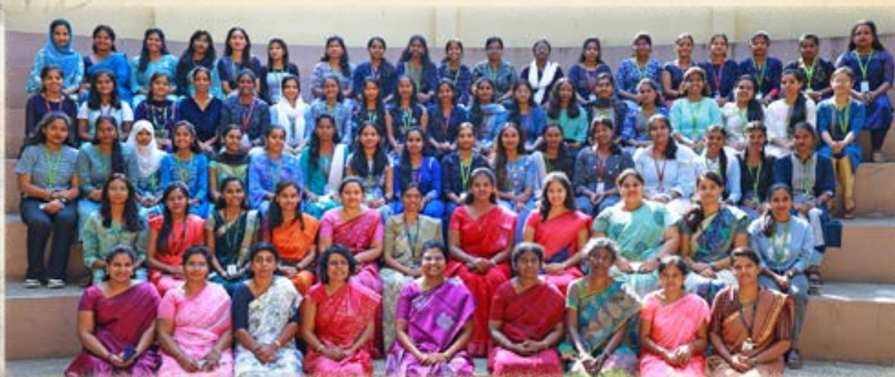
B.A. English Aided