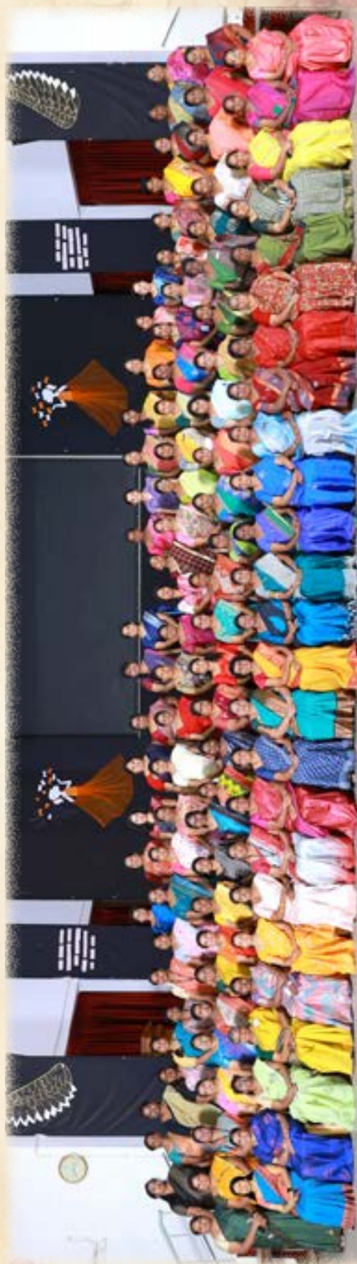
Our Faculty Team (Aided)