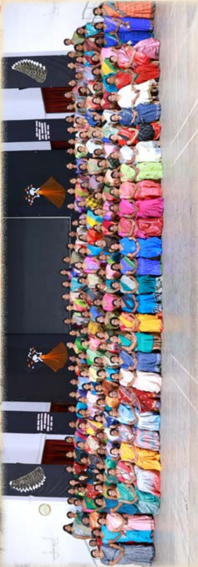
Our Faculty Team (Management)