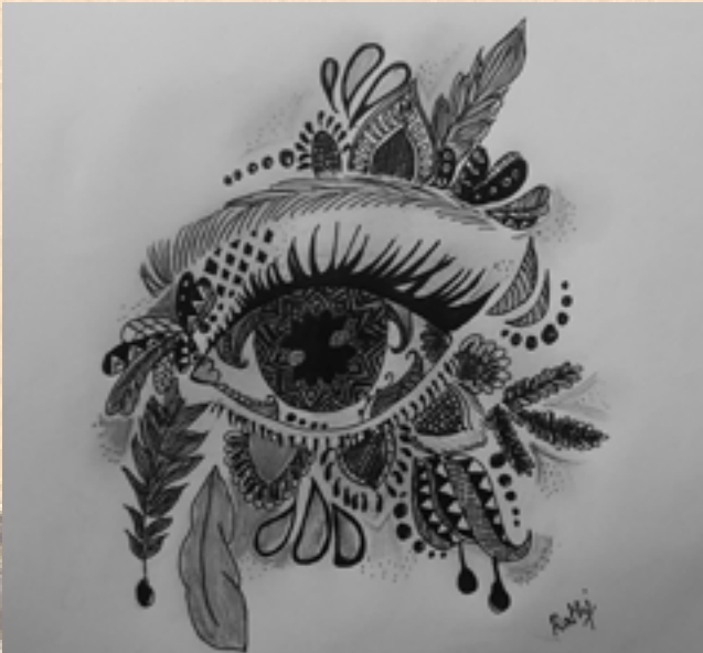
Sowmia Rathi 24PGM034