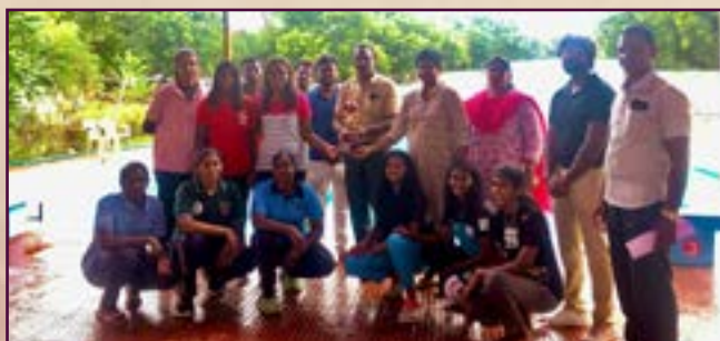
MKU Swimming Champions