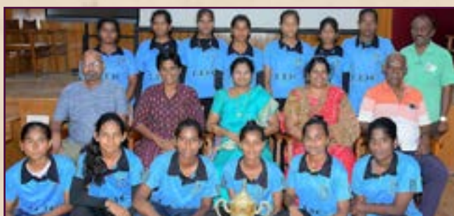
MKU Hockey Champions