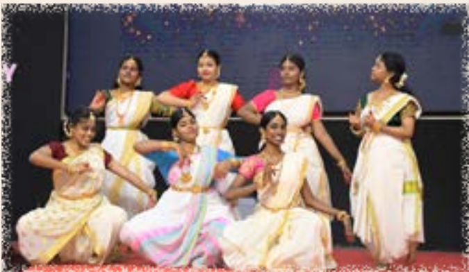
Teachers' Day Celebration