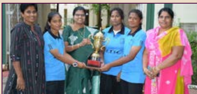
MKU Judo Champions