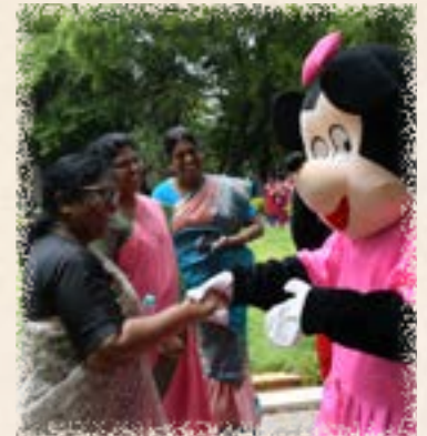
World Mental Health Day