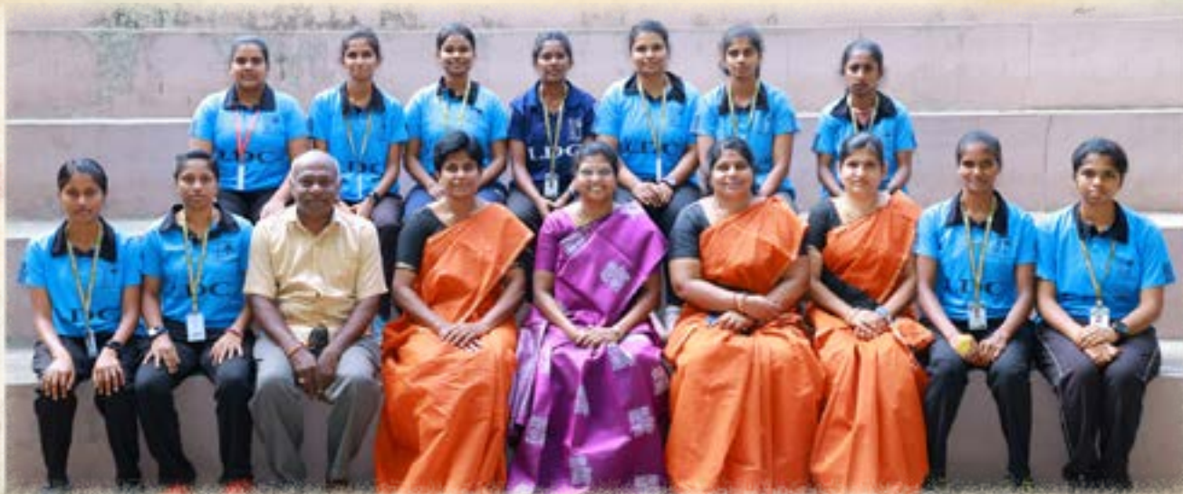
Diploma in Fitness Training