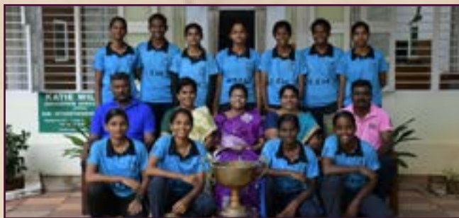
MKU Volleyball Champions