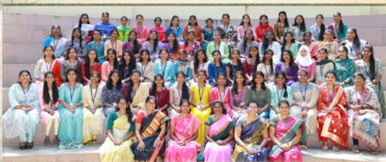
B.Com. Banking Insurance