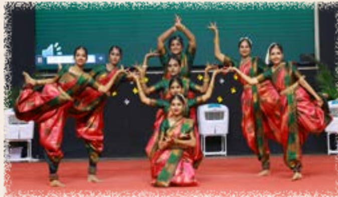
College Day & Student Cabinet Valediction