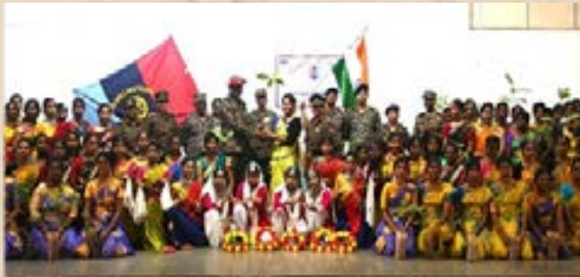
76th NCC Raising Day at NCC Training Academy, Idaiyappatti