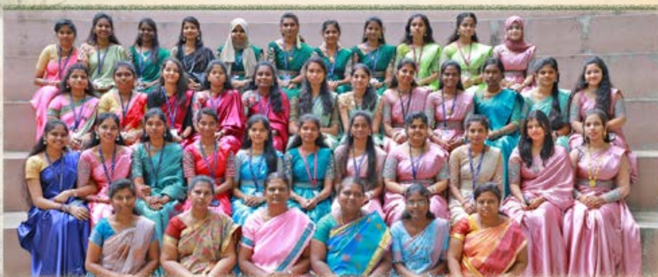
B.Sc. Mathematics (SF)