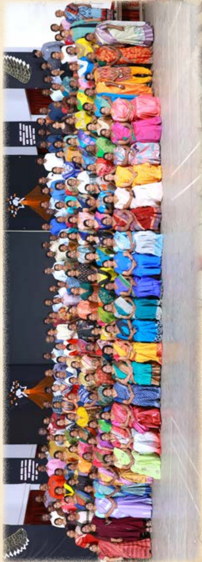
Our Administration and Support Staff