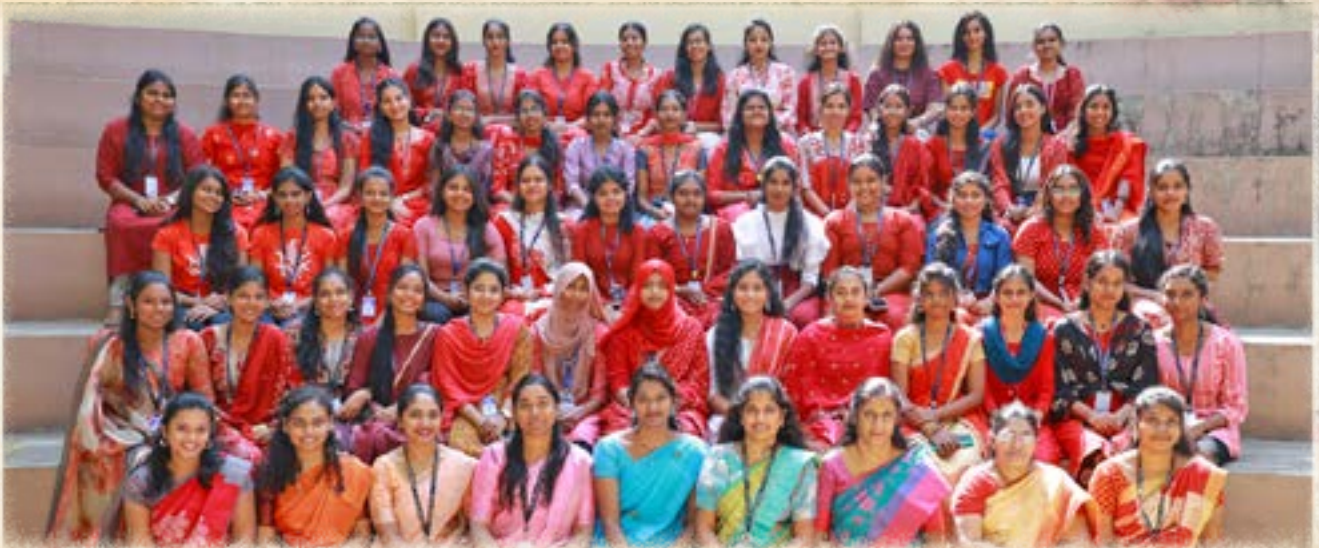
B.A. English SF