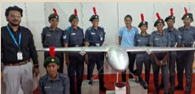
All India level tech fest, Vigyan Expo