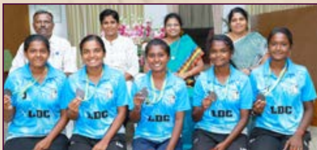
Final Ball Badminton - AIU Third Place