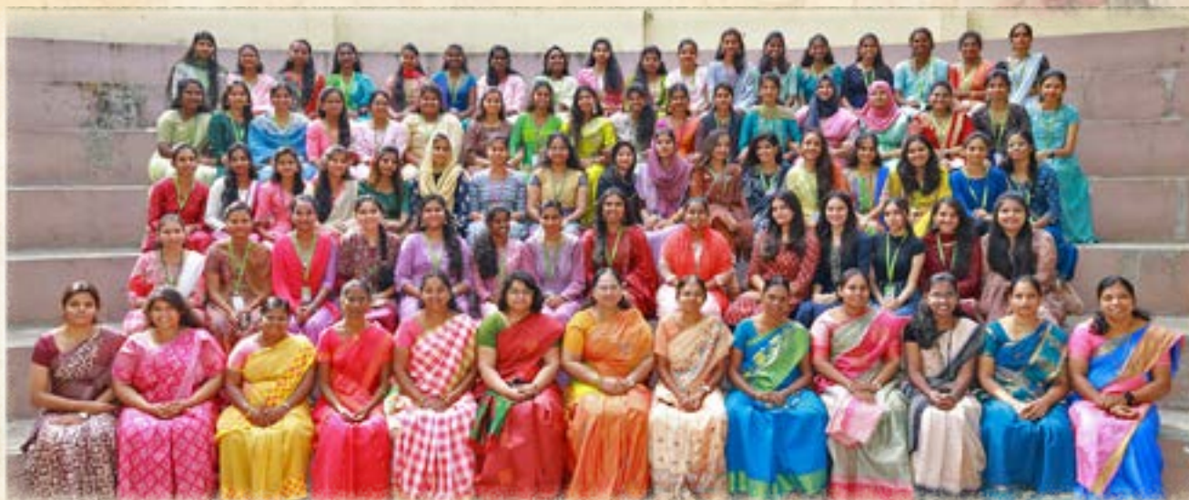
B.A. Economics (EM)