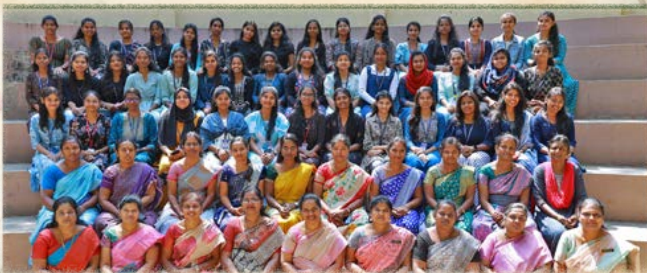
B.Sc. Information Technology & Management (B)