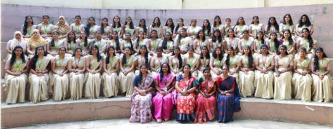
B.A. Psychology & Sociology