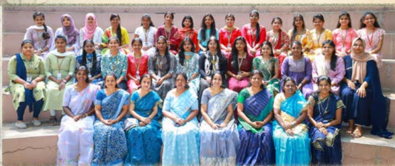
PG Diploma in Human Resource Development