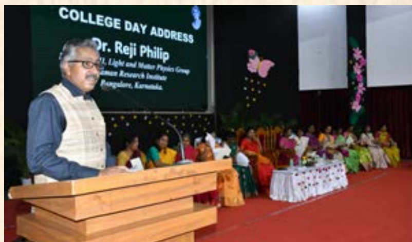
College Day Celebrations