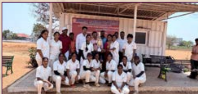
Champions in the Intercollegiate Cricket Tournament at MRCAS College, Madurai