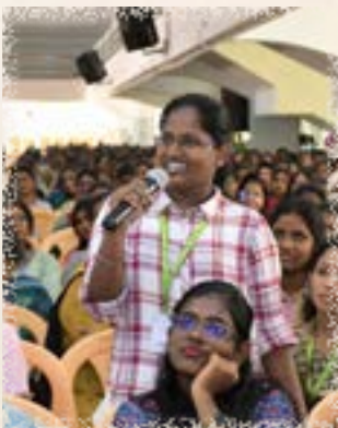
IAS Academy Orientation