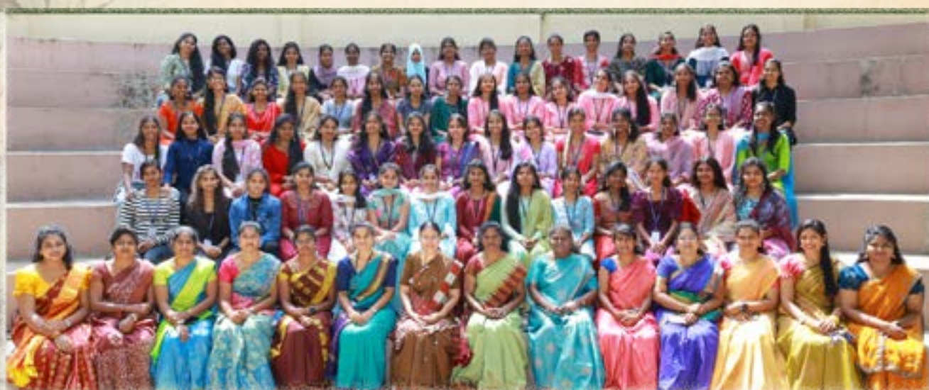
B.Com. Professional Accounting