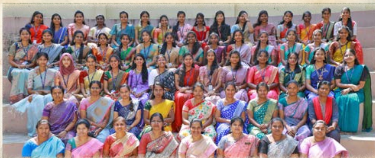
B.Sc. Computer Science